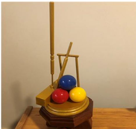
Golden Mallet Award