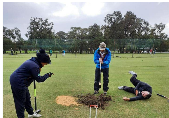
Faults WA style: just a bit of court damage