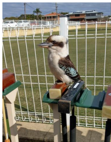
Kookaburra making a mallet selection at South West Rocks.

For more information about the Grants Program, please email NSWSeniorsFestival@fac.nsw.gov.au