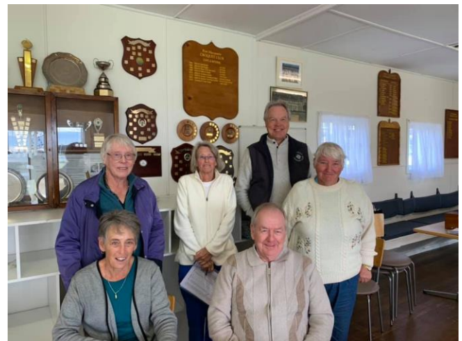
3 REFEREES FROM MID NORTH COAST AND COFFS COAST FOLLOWING REACCREDITATION

Rules Books can be purchased via the Merchandising Officer .